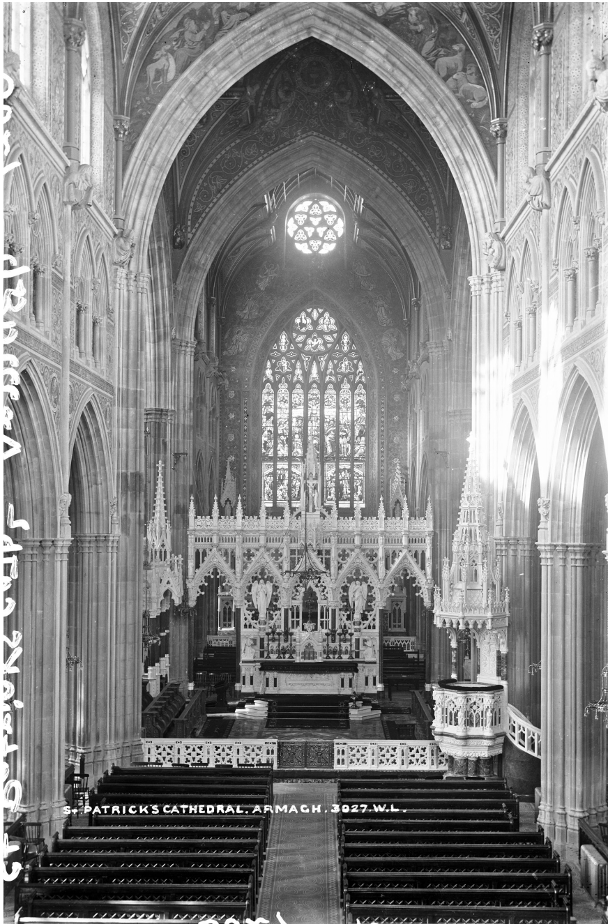
Fig. 2. Saint Patrick's Roman Catholic Cathedral, Armagh, interior with rood screen before removal (Courtesy of the National Library of Ireland).