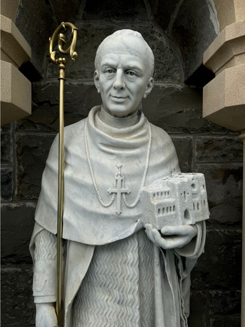
Fig. 9. Pietro Lazzerini, Bishop Charles MacNally , South Transept, Monaghan Cathedral.