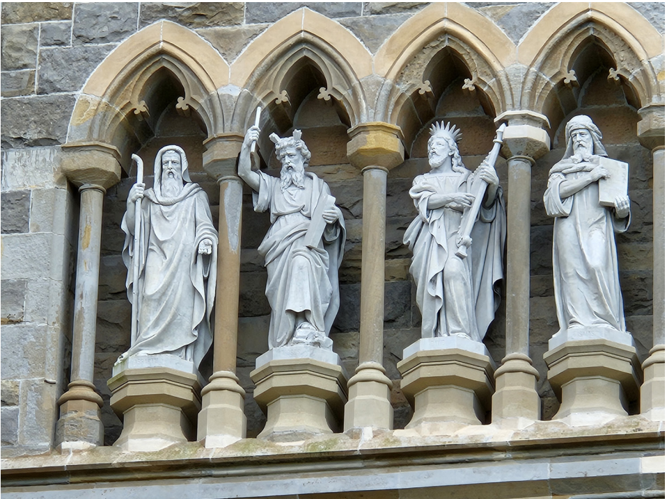
Fig. 4. Pietro Lazzerini, figures from North Transept, Saint Macartan's Cathedral, Monaghan.