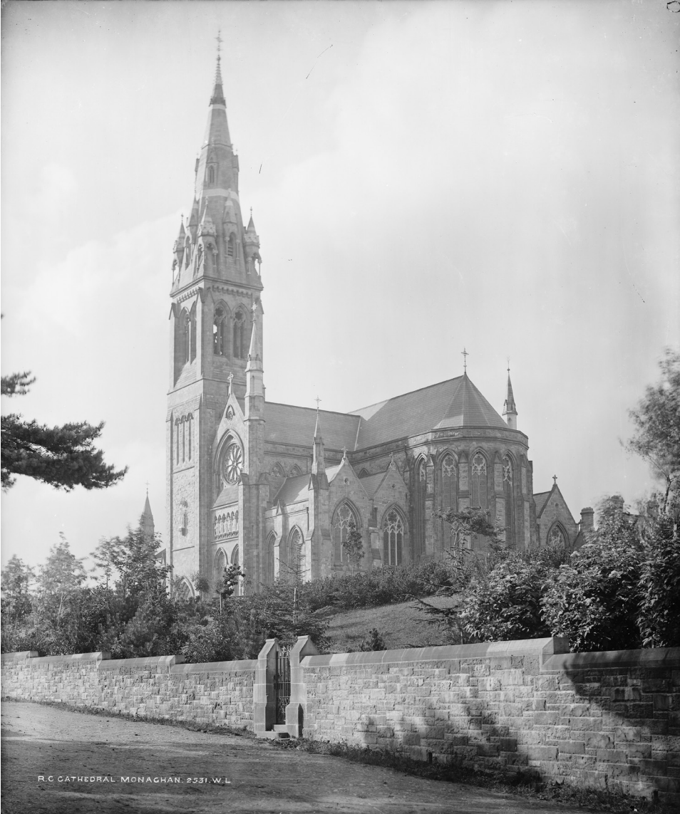
Fig. 8. Saint Macartan's Cathedral Monaghan, exterior.