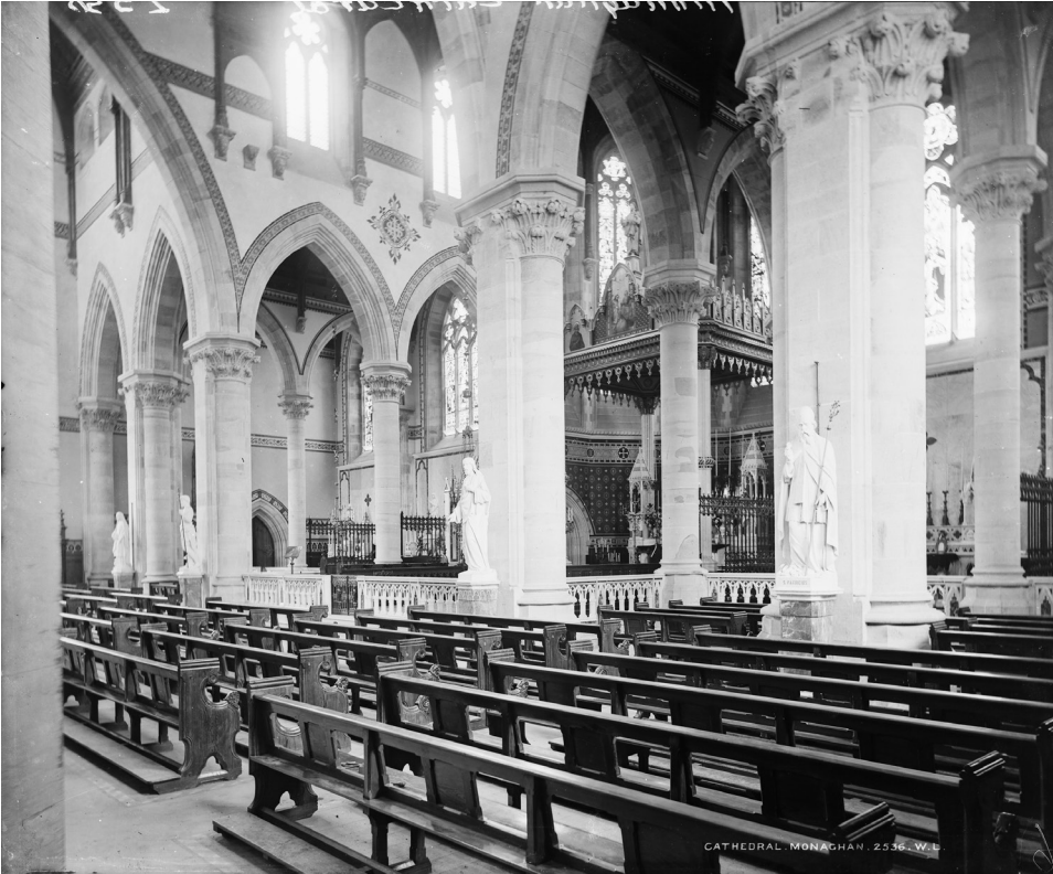
Fig. 3. Interior of Saint MacCartan's Roman Catholic Cathedral, Monaghan (Courtesy of the National Library of Ireland).