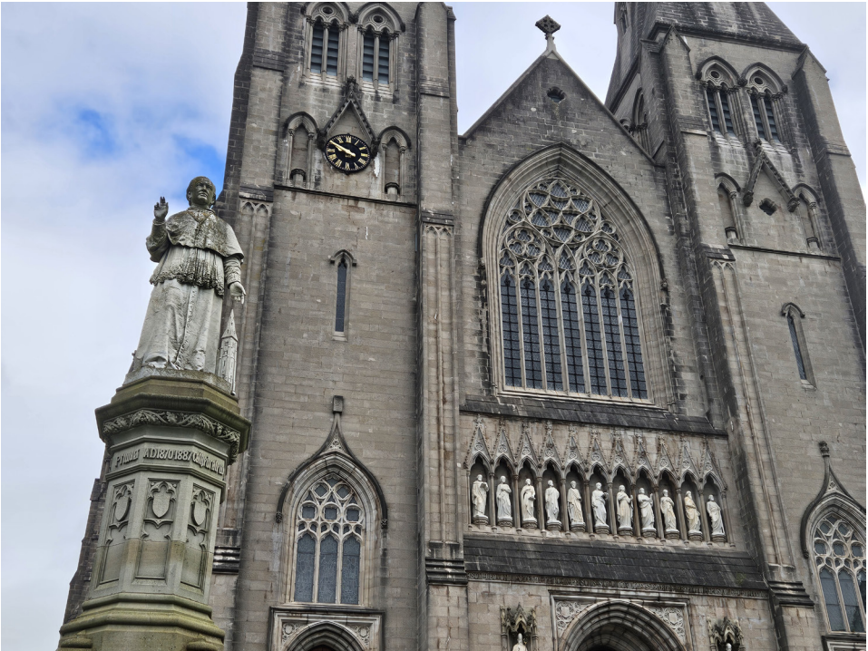
Fig. 1. Saint Patrick's Roman Catholic Cathedral, Armagh, west front with statue of Archbishop McGettigan.