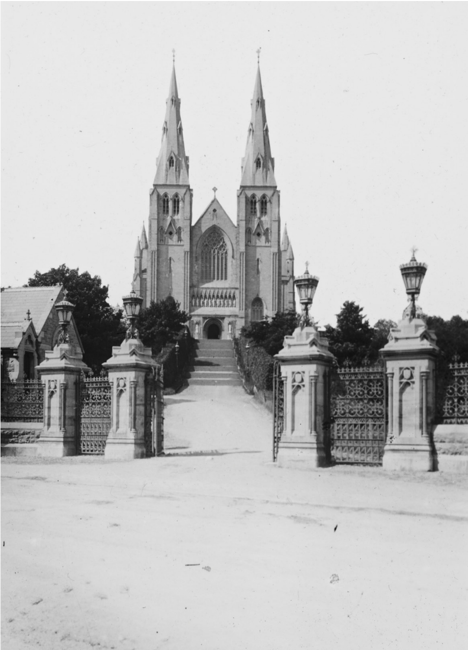
Fig. 5. Saint Patrick's Roman Catholic Cathedral, Armagh.